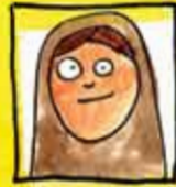
BILHAH (RACHEL'S MAID)