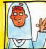
ZILPAH (LEAH'S MAID)