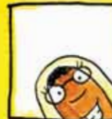
DINAH (DADDY'S LITTLE PRINCESS)