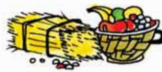
NOW SERVING YOUR IN-FLOAT MEAL (GENESIS 6:21)