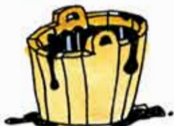
BUCKET O' PITCH (GENESIS 6:14)