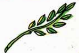
OLIVE BRANCH! (GENESIS 8:11)