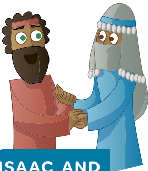
ISAAC AND REBEKAH