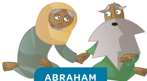
ABRAHAM AND SARAH