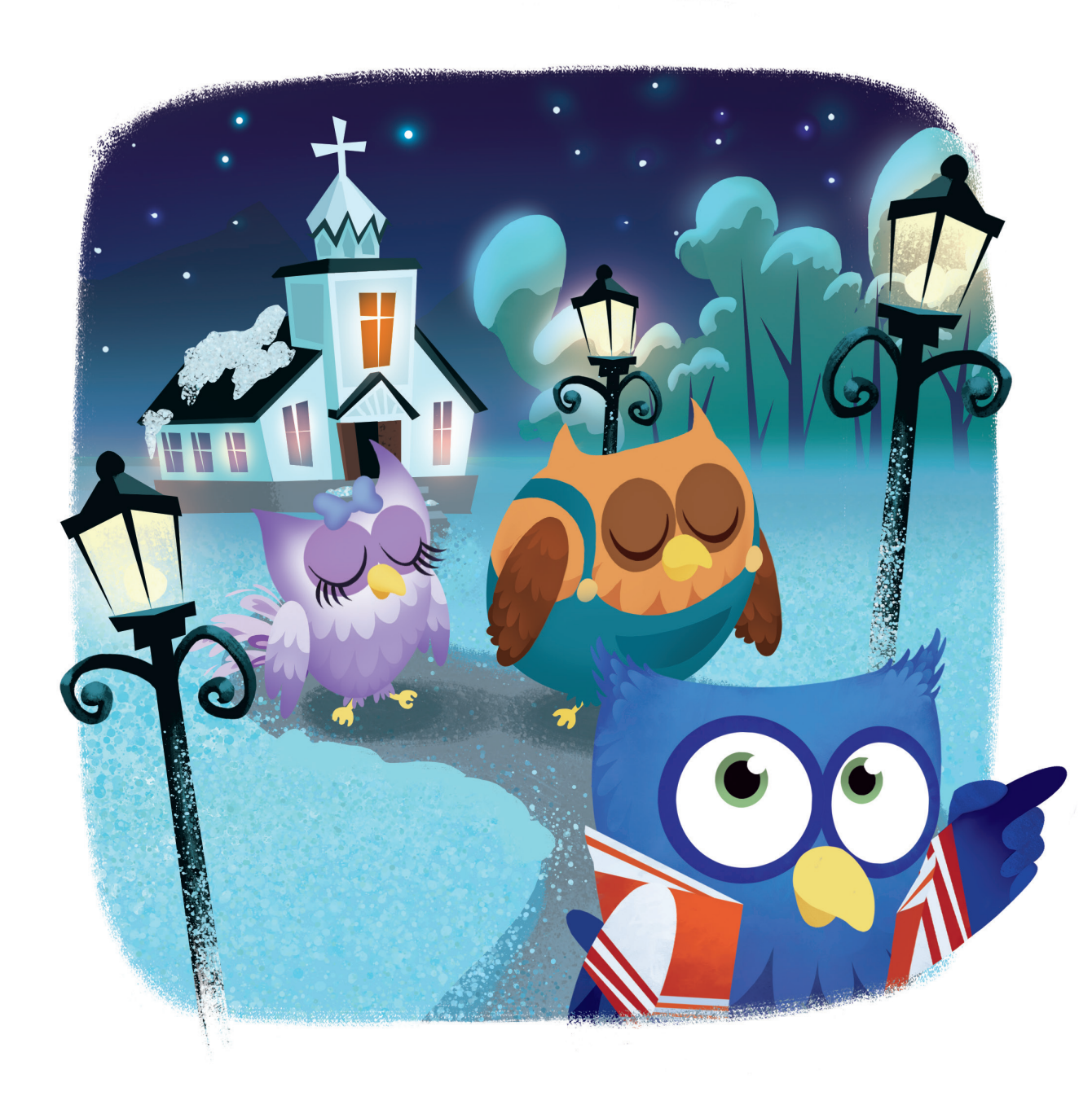
"Follow me!" Joey shouted, "I'll lead the way!"