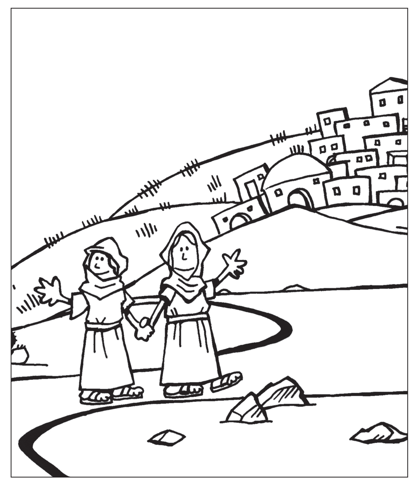
Ruth stayed with Naomi.