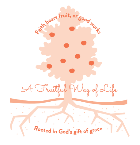
Your life is not about you; you are about life.

This is good news! Because of God's grace, we are free to live the life we were meant to live—serving others and sharing in the joy of our salvation.